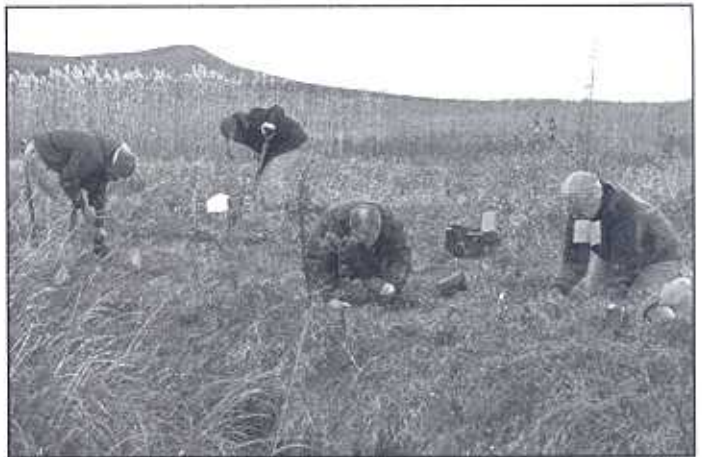
Planting along the creek

Do not expect to see sudden changes at the Mound, but over the next several years, you can expect to observe progress toward a more diverse prairie and an associated increase in butterflies and other species. Something to anticipate on your future visits!