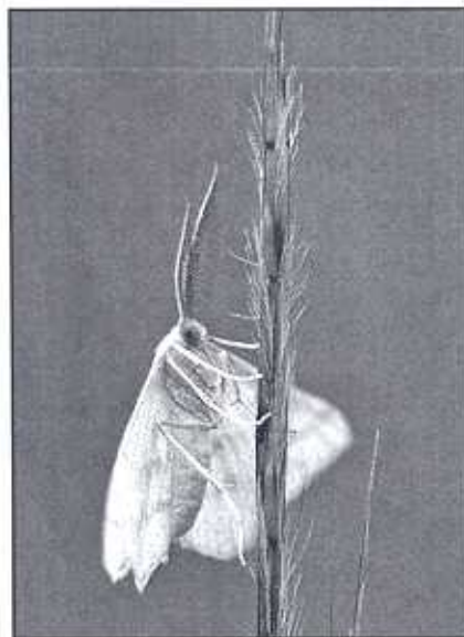
Chickweed Geometer Moth

These new tools seem to be putting popular insect study where the new Peterson Field Guide to Birds put birding in the 1930s. And it's true that more visi-