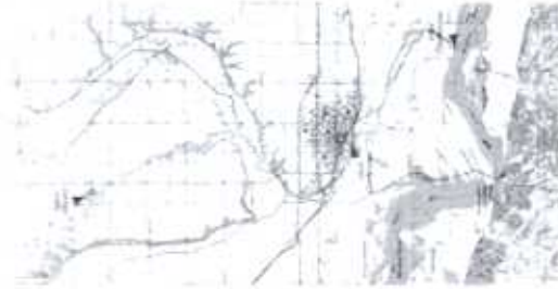
Confluence of Spirit Mound area on U.S. Geological Survey 1994 topographic quadrangle

In 2004, the bicentennial of the Lewis & Clark Expedition, the Vermillion River's mouth was about 3.5 miles southeast of the old White Stone River's mouth at its 1804 confluence with the Missouri River near this Cotton Park site.