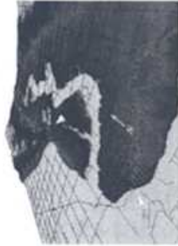
Spirit Mound, Spirit Mound, Missouri, 1804

On August 24, 1804, nearly 50 men in two pirogues and a keelboat passed by on their way upriver, making camp on the Missouri southwest of the mouth of the White Stone River or Creek, now known as the Vermillion River. The next day, as the main party continued west, a mysterious mound, thought by native peoples to be occupied by powerful spirits, drew Lewis & Clark and a small group of explorers back to the White Stone River, where they left their pirogue & began a day-long overland visit to Spirit Mound.