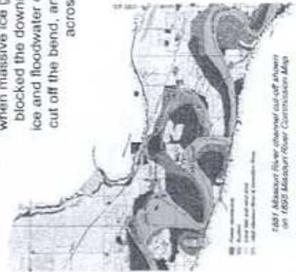
1881 Missouri River channel cut-off shown on 1893 Missouri River Commission Map

No longer a riverboat landing, the town of Vermillion was rebuilt above the bluff by people made mindful of the power of the living River.