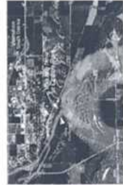
Clark's 1804 Route Map, respectively on upper elevation study

The Missouri River continued to flow in a 'great bend' near this spot beneath the bluff until Spring 1881, when massive ice gorges broke upriver and blocked the downriver flow. The deluge of ice and floodwater destroyed old Vermillion, cut off the bend, and carved a new channel across the land south of here.